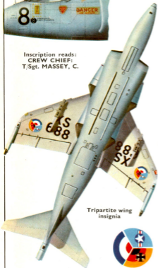
Tripartite wing insignia